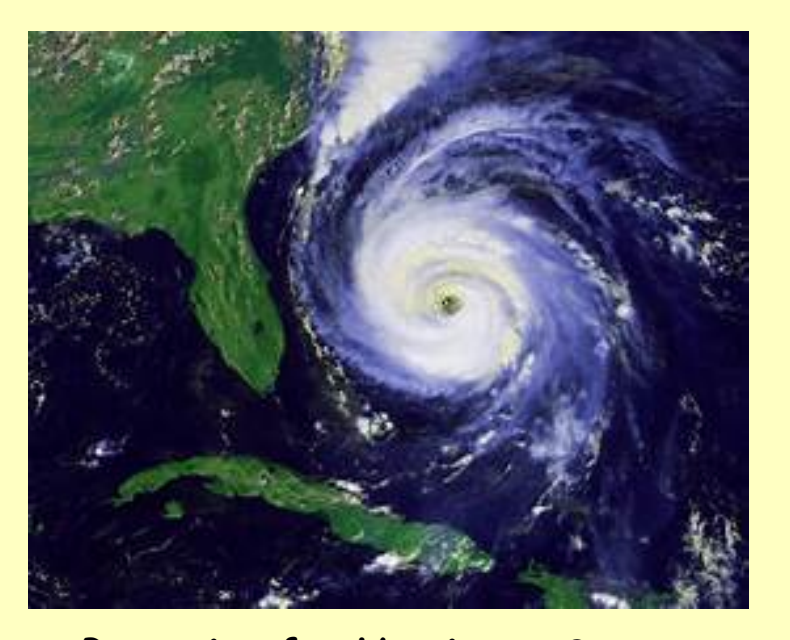
Preparing for Hurricane Season

The Social Committee hopes to bring many events like this to the community. If you're looking to get involved reach out to the board. We always need more hands.