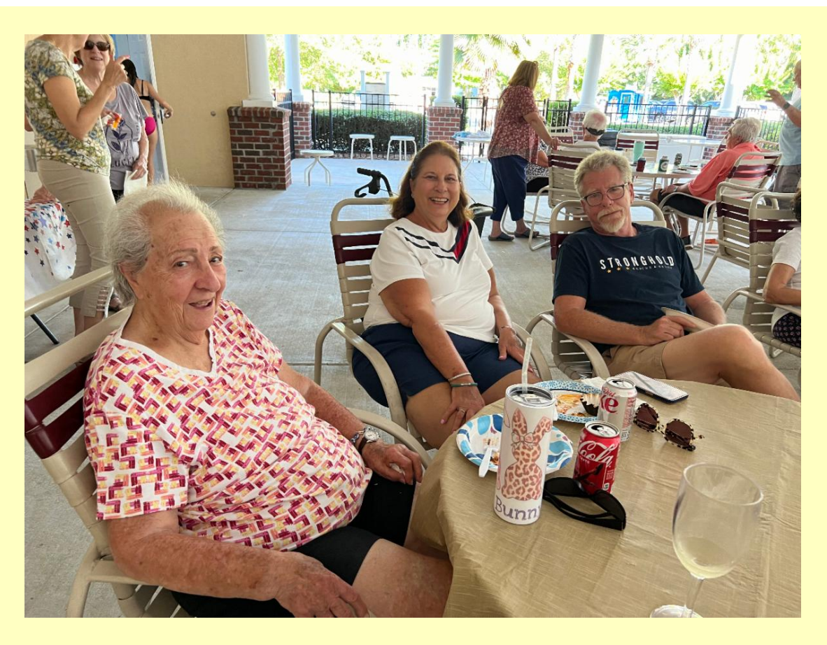
Flag Day Social Event

On Flag Day, June 14<sup>th</sup>, several BP neighbors came together for a social in the pool pavilion. As you can see, the food was plentiful. We have great cooks in Baynard Park!