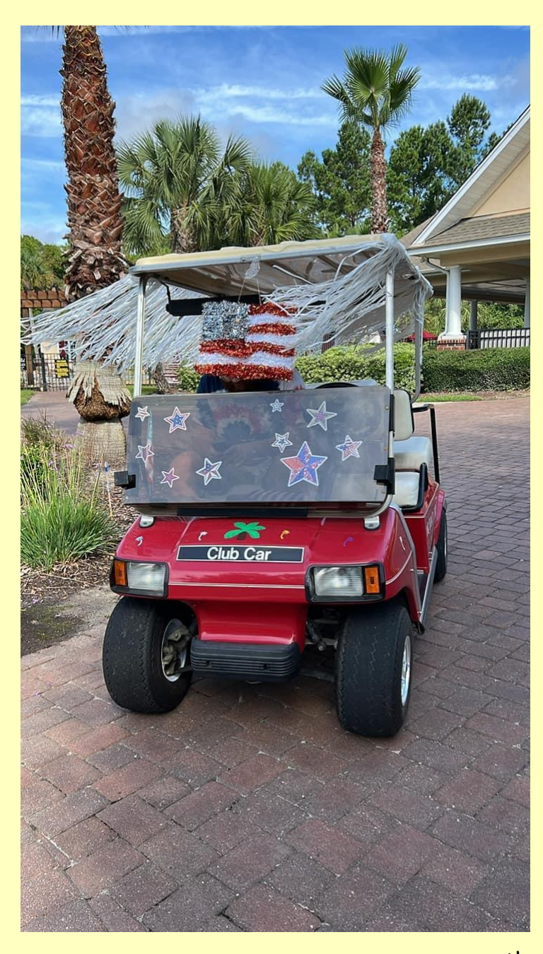
An inaugural golf cart and bike parade was held on the 4^{th} of July to celebrate the birth of our nation. Hope we see this again next year!